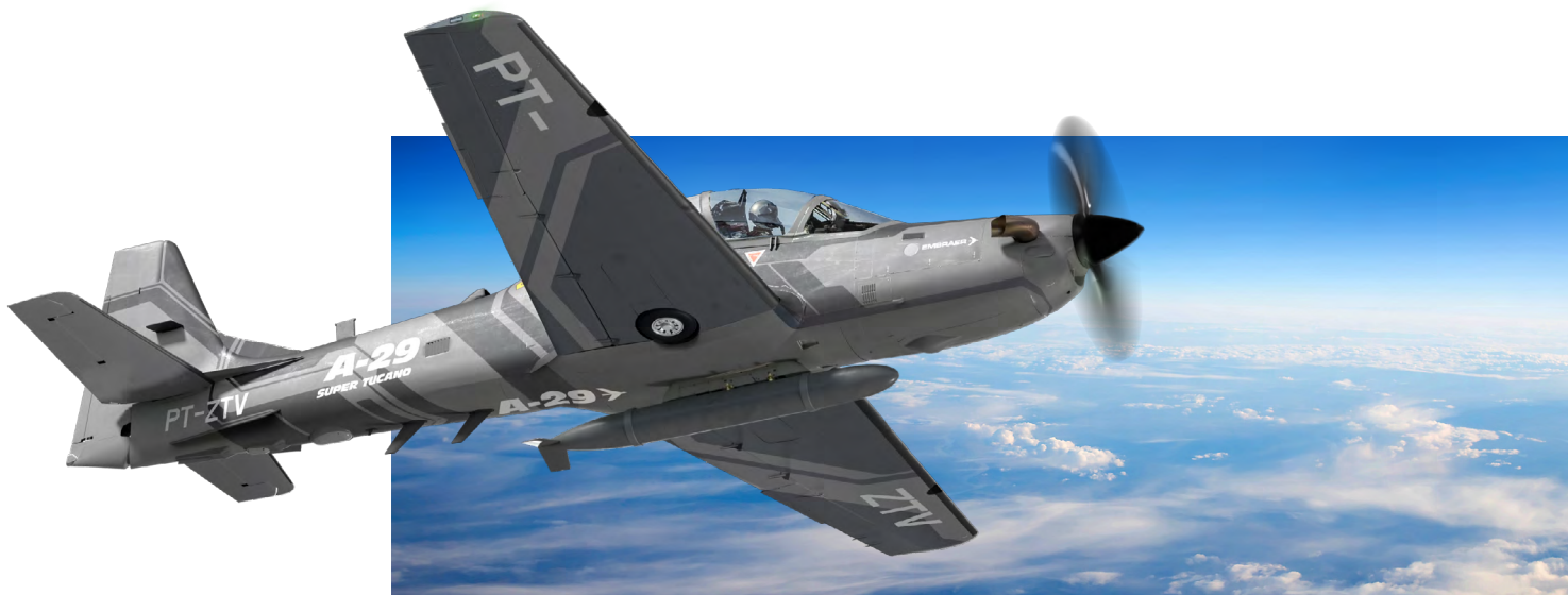
A-29 Super Tucano