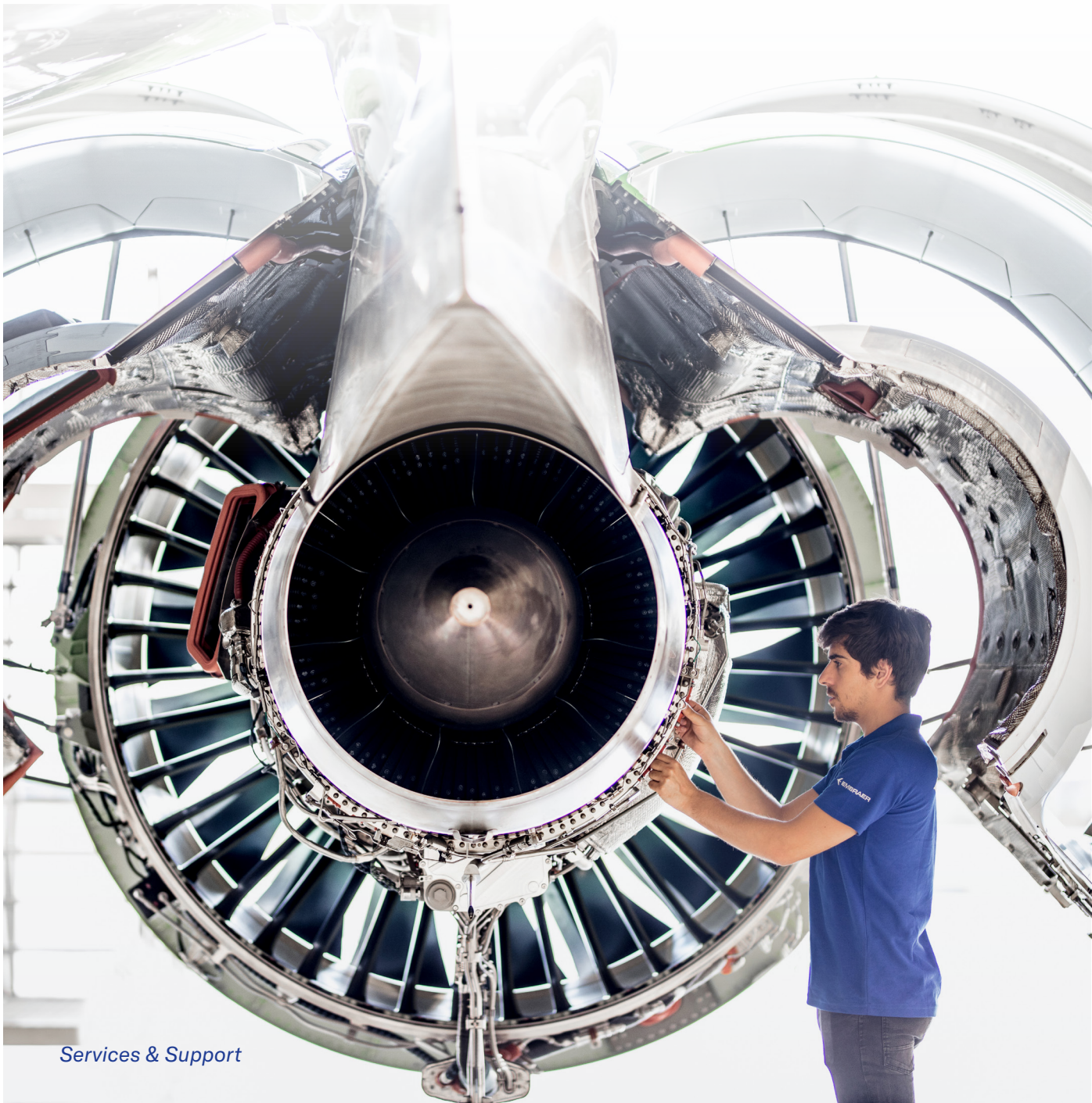
Services & Support

The Services & Support unit continues to be one of the main drivers of Embraer's growth through a combination of operational excellence, customer experience and innovative solutions. Its backlog ended 2Q24 roughly unchanged at US$3.1 billion.