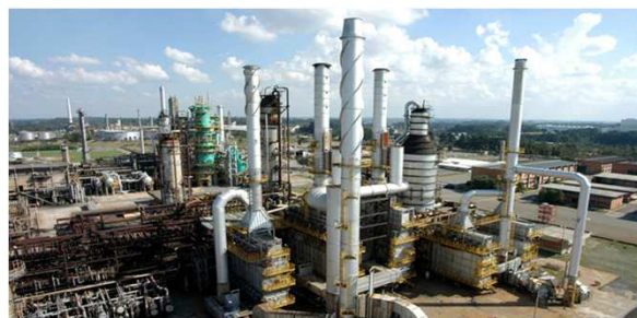
REPAR – Presidente Getúlio Vargas