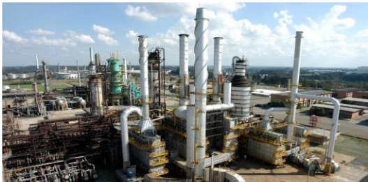
REPAR – Presidente Getúlio Vargas