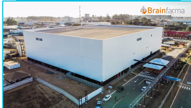
New Plant for Injectables

➤ New plant to triple the current injectables capacity