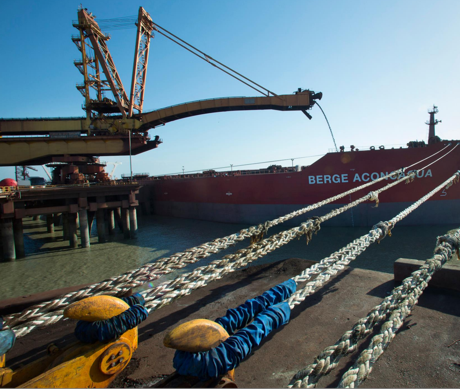
Loading ship at Ponta da Madeira Maritime Port, São Luís, MA, Brazil.