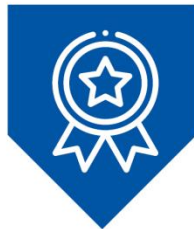
Programa Terminal Campeão