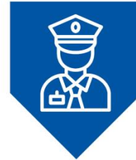
Programa de Segurança