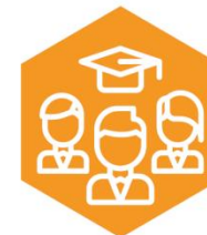
Programa Primeira Geração (PriG)