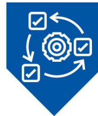
Inovação de processos e operações