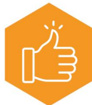
Jeito Log-In de Encantar