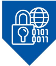
Programa de Cybersegurança