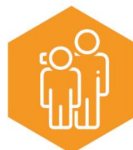
Programa Jovem Aprendiz