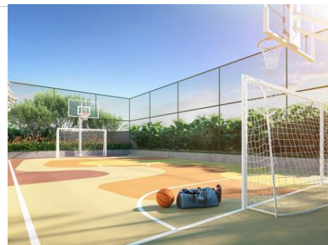
Illustrated perspective of the Sports Court

With 47 years of operations , EZTEC is one of the most profitable publicly-traded companies in Brazil's real estate development and building industry. Based on its fully integrated business model, EZTEC has already launched 197 projects , totaling more than 5.8 million square meters of built area and area under construction, and 48,006 units .