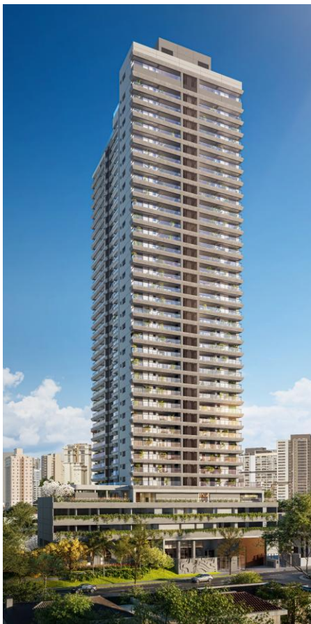
Illustrated perspective of the facade