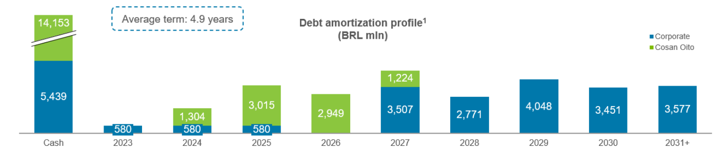
Note 1: Only considers the principal value of the debts, without taking into account the interest and MTM. It treats Perpetual Notes in 2031+.

The Company has a comfortable principal amortization schedule, as shown in the chart below, considering the flexibility and optionality of the financing structure for the acquisition of the interest in Vale. The average term of our debt is approximately five years.