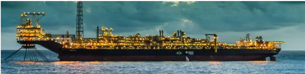
The OSX-3 FPSO on the TBMT Field

The Transaction is taking place in conjunction with PetroRio’s acquisition of the OSX-3 Floating, Production, Storage and Offload vessel (“OSX-3 FPSO”). The OSX-3 FPSO was acquired by PetroRio from its owner, OSX3 Leasing B.V., who was chartering the FPSO to Dommo for use on the TBMT field.