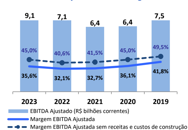
Adjusted EBITDA and Adjusted EBITDA Margin Track Record

Adjusted EBITDA totaled R$ 9,104.7 million, up by 28.5% over the R$ 7,087.7 million reported in 2022. The Adjusted EBITDA margin was 35.6% in 2023, compared to 32.1% in 2022. Excluding the effects of revenue and construction costs, the adjusted EBITDA margin reached 45.0% in 2023, compared to 40.6% in 2022.