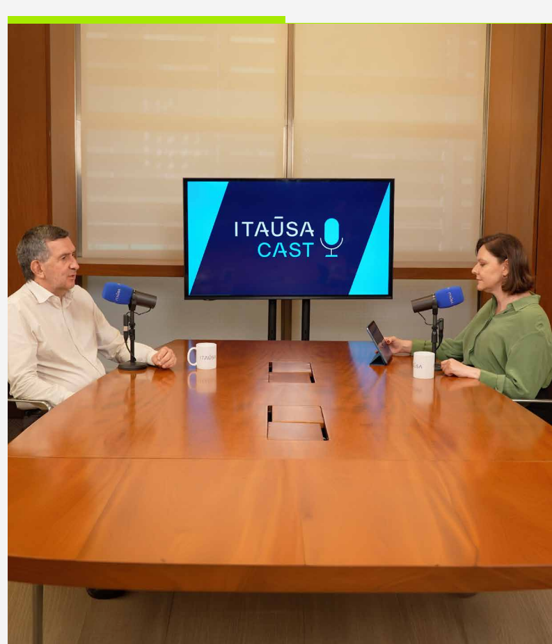
Automatic English subtitles are available on YouTube.

CLICK HERE FOR A FULL REVIEW OF OUR EARNING.