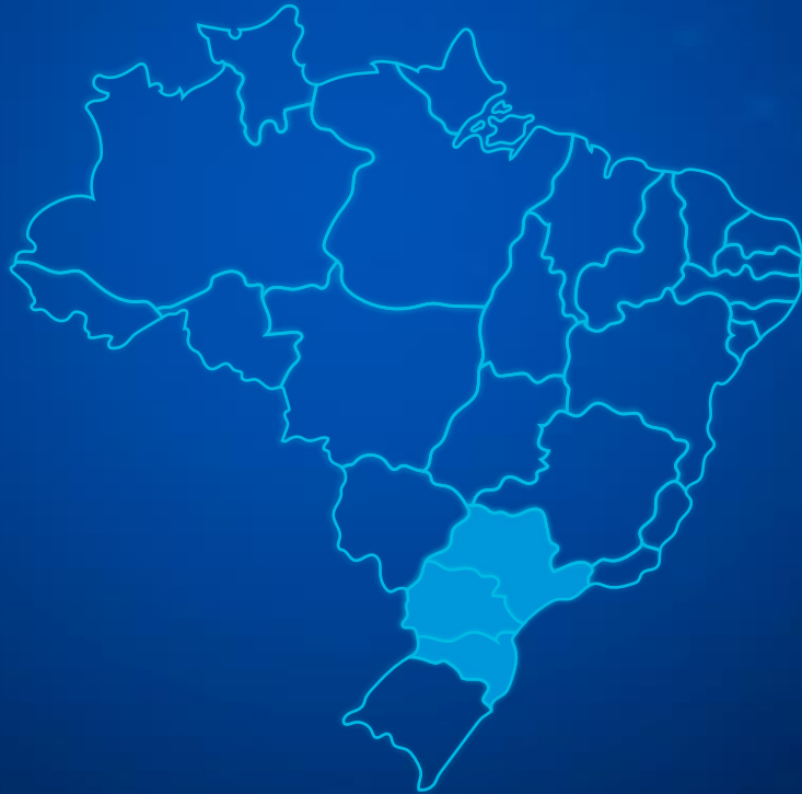
Ambev Tech Blumenau

OUR KEY OFFICES ARE LOCATED IN 3 DIFFERENT CITIES; CAMPINAS (SP), BLUMENAU (SC) AND SÃO PAULO (SP), WITH ADDITIONAL OFFICES IN MARINGÁ (PR), SOROCABA (SP), JAGUARIÚNA (SP), BUENOS AIRES (AR) AND ALSO PEOPLE IN FULL HOME OFFICE ACROSS BRAZIL