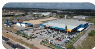
Nossa Senhora do Socorro (SE)