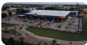
Porto Velho (RO)

During 1Q22, Assaí opened 4 new stores, of which 2 in the North and 2 in the Northeast, expanding the footprint in regions with high growth potential. In the last 12 months, 32 stores were inaugurated, which represents an expansion of 22% in total sales area and attests the Company's top-notch execution capacity. Currently, there are 216 Assaí stores in operation with total sales area of 986 thousand sqm.